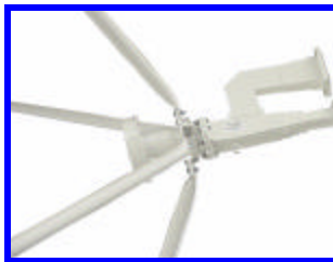
2-Port Tx/Rx C-Band Feed